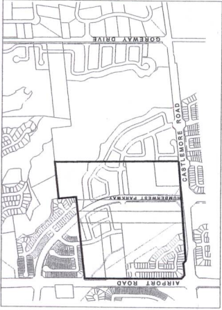
KEY MAP: n.t.s. Block Plan Area 42-1

231 Oak Park Boulevard, Suite 206 14-000 202 Street, Unit 206 Brampton, Ontario