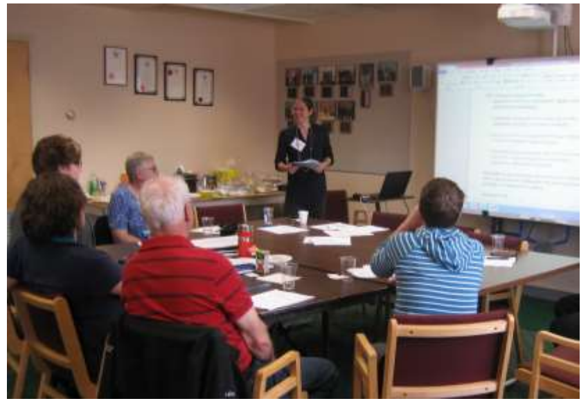
Age-Friendly Committee meetings, County of Frontenac and Dubreuilville