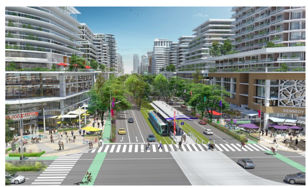
Figure 1: A conceptual rendering of "Queens Boulevard" from the Brampton 2040 Vision.

The area proposed to be included in the Community Planning Permit System is referred to as 'Queen's Boulevard' in the Brampton 2040 Vision. The Brampton 2040 Vision envisions the Queens Boulevard to be "a tight corridor of higher density and scale with mixed uses and continuous commerce at grade. Buildings will all adhere closely to the street with a continuous streetwall and activities spilling out on ample sidewalks – cafes, shopping, and amenities – with several lines of large trees and special lighting. It will be a transit spine – an actual streetcar will be very iconic. Most people will walk because the sidewalk will be the happening place. It will have public art, expressive architecture and various special features to instill a stylish character. It will showcase the latest trends in green city-building as a pilot project of the Institute for Sustainable Brampton. Behind the front row of buildings, a second row of development, on the parallel streets, scaled to step down buildings from the central spine, could ultimately reinforce the corridor."