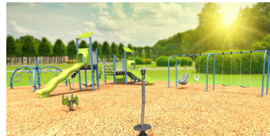
Banting Park Playground Concept

Illustrations are an artist's concept and may be subject to change E&O.E.