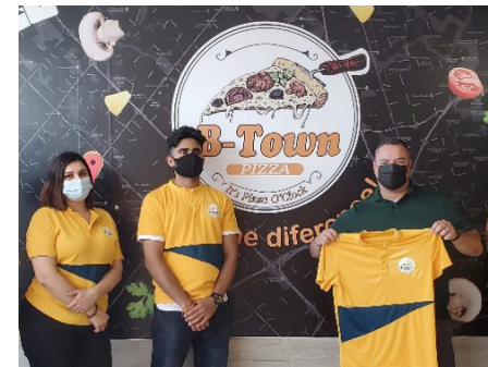
At the official launch of the B-Town Pizza shop at 8975 McLaughlin Road South.