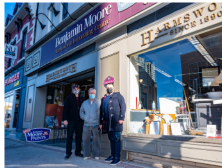
Brampton's Main Street has a number of great businesses, both old and new.