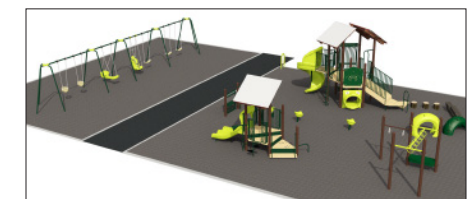
Sheridan Woodlands Park Playground Concept