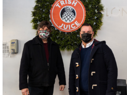
The Councillors took a break to enjoy some fresh smoothies at Trish Juice. What's your favourite menu item?