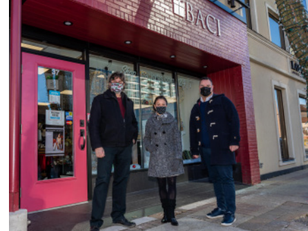
Outside of Baci Gifts, a great place to start and finish all your holiday shopping for your loved ones.