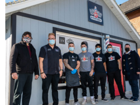
It's great to see local businesses back to work, serving the community, like Al's Barber Shop.