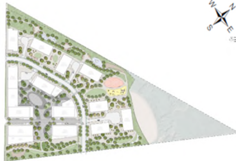
Proposed Concept Site Plan

The proposed development requires an Official Plan Amendment to amend the existing designation from 'NW Brampton Urban Development Area' and 'Open Space' to 'Residential' and 'Open Space'. An amendment to the Mount Pleasant Secondary Plan is also required to amend the existing designation from Special Policy Area 2' to 'Residential High Density' and 'Natural Heritage System Area'. A Zoning By-law Amendment application to amend the existing zoning from 'Agricultural (A)' to 'Residential Apartment B (R4B-XX)'.