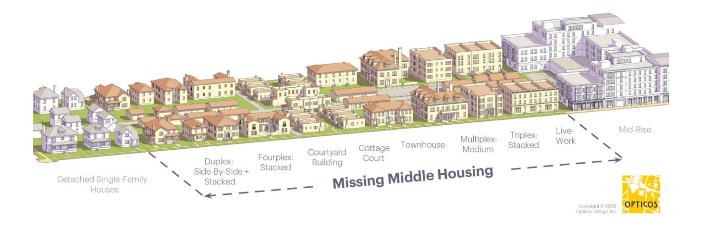
Figure 2: Missing middle housing typologies diagram developed by Opticos Design Inc.

Missing middle housing typologies will play an important role in supporting the City's housing needs. Generally, Brampton Plan recognizes supporting missing middle housing typologies as an important means to achieve intensification and transitions in the built form. Through the Residential Zone Review Memo, the City and WSP will explore opportunities to permit missing middle housing typologies city-wide, where appropriate, in conjunction with an analysis of existing residential zones.