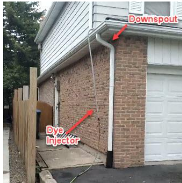
At your Home

Bright coloured dyed water may be visible – the colours normally used are green, red and blue.