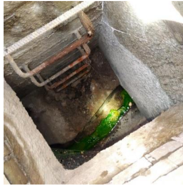
In the Sewer