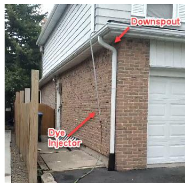
At your Home

Bright coloured dyed water may be visible – the colours normally used are green, red and blue.