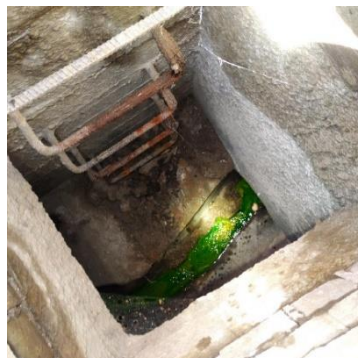
In the Sewer