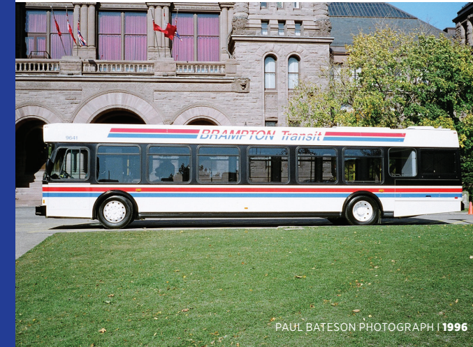
PAUL BATESON PHOTOGRAPH | 1996